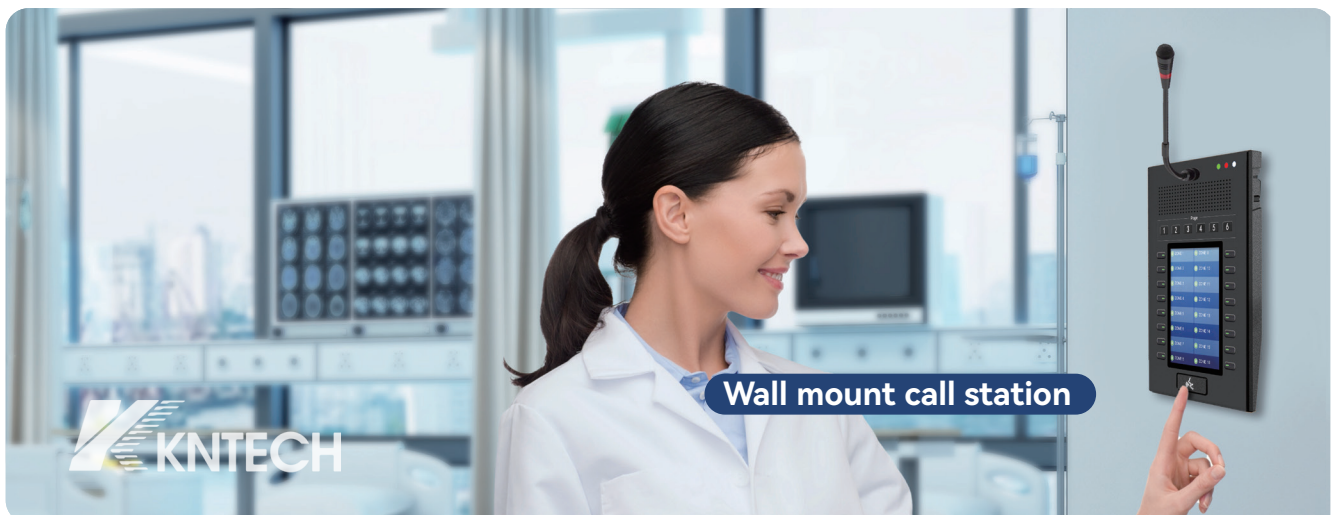
Wall mount call station