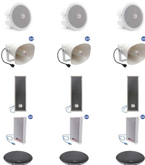
Ceiling Speaker KNSIPSP-L9