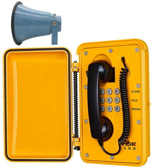
VOIP KNSP-08L2-IP-Y Loudspeaker Phone