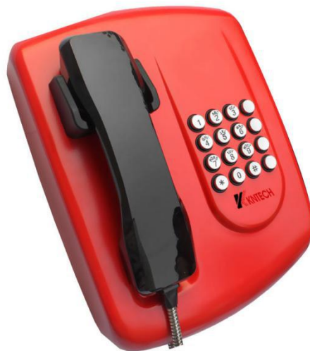
VOIP KNZD-04 Public Phone