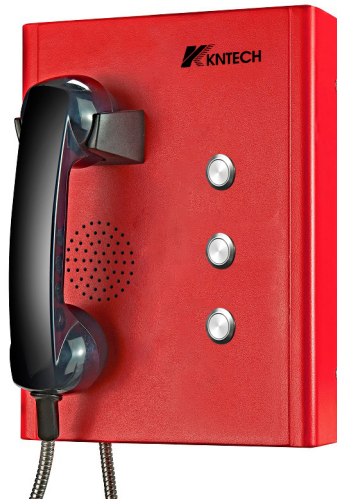
VoIP KNZD-27A Public Telephone