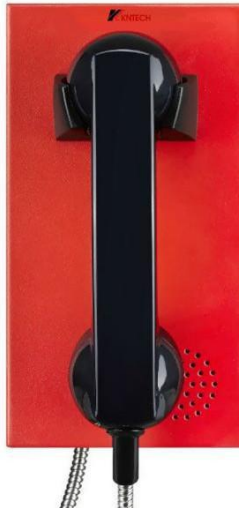
Analogue KNZD-14 Hotline Phone