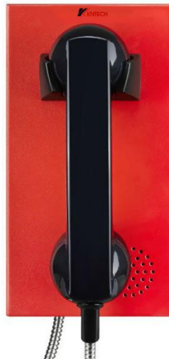
Analogue KNZD-14 Hotline Phone