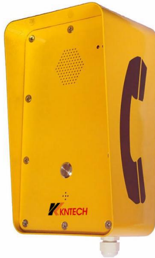
Highway Emergency Phone