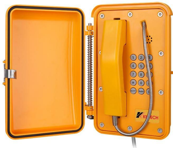
VOIP KNSP-19-IP-Y Water roof Phone