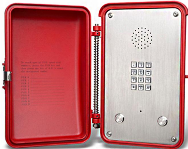
VOIP KNSP-15MT-IP-R WaterproofPhone