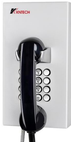
Analogue KNZD-05 Emergency Phone