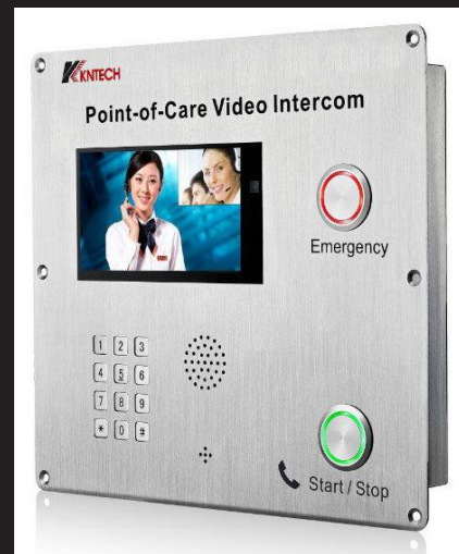
Flushed Mounting Type