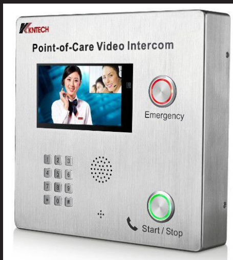
Wall Mounting Type