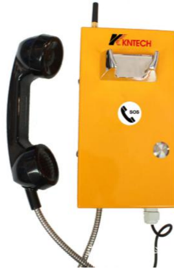
KNZD-14 GSM Hotline Telephone