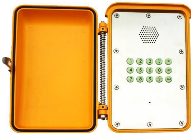
VOIP KNSP-13MT-IP-Y Waterproof Telephone